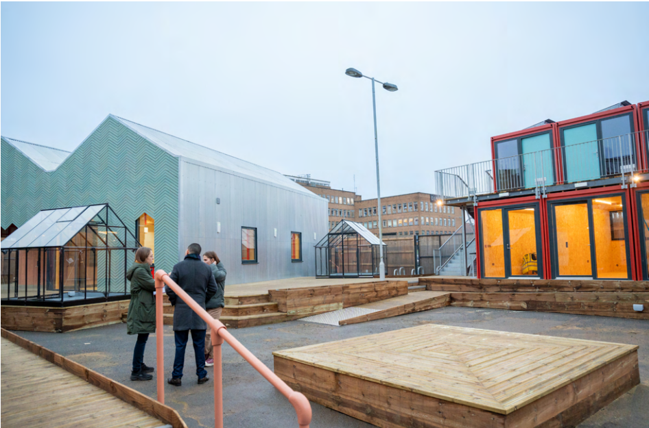
2x plinths + courtyard eventspace