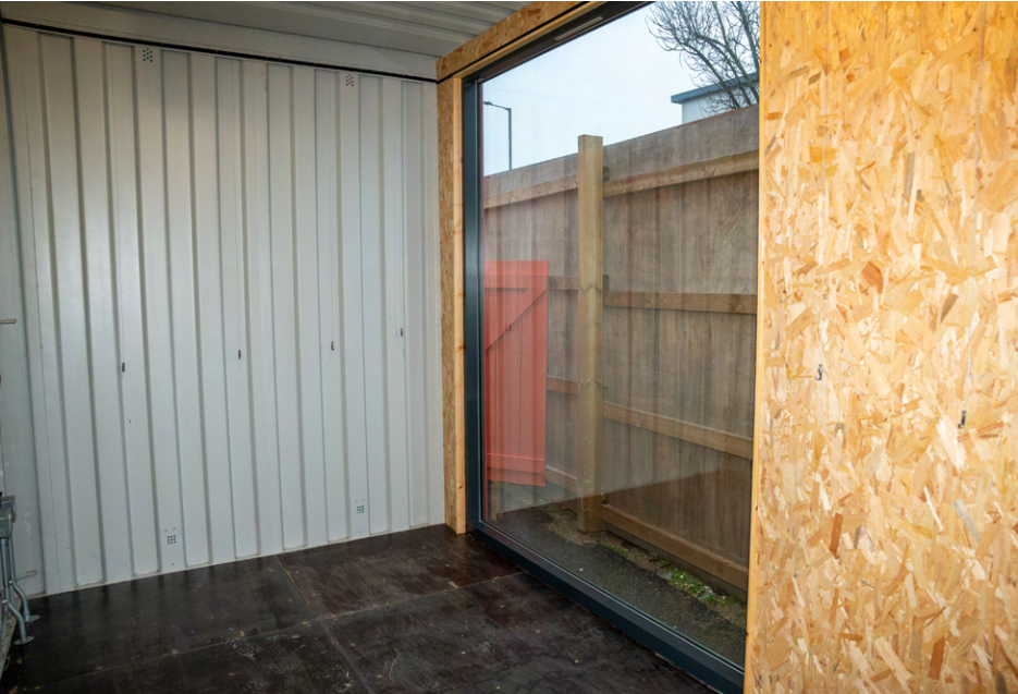
1x Large gallery