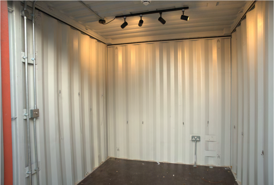
2x Small galleries